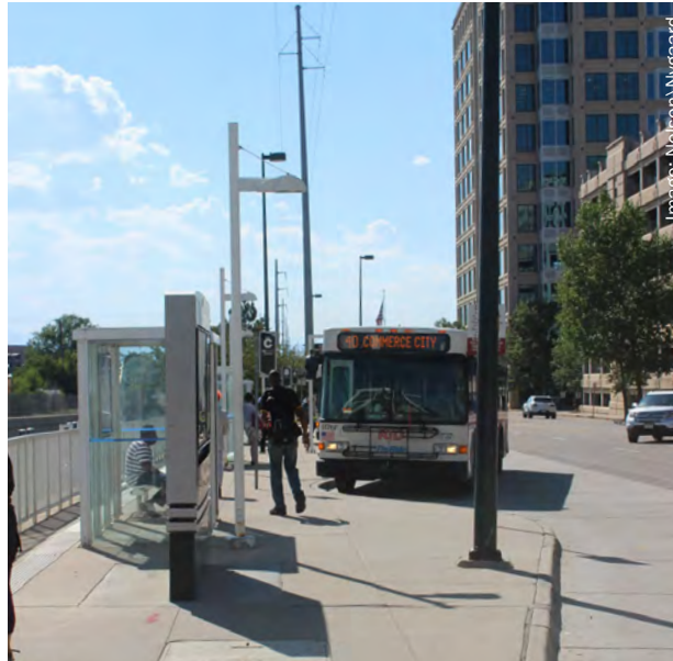
This bus stop adjacent to Colorado light rail station includes shelters, printed and real-time information, and pedestrian-scale lighting.