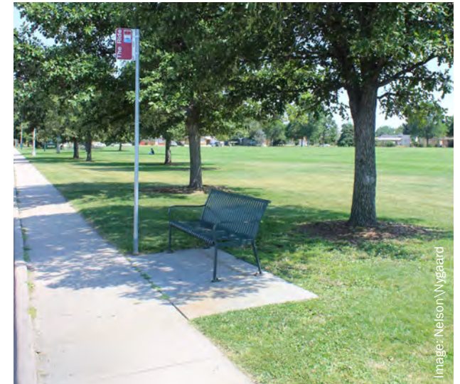
Basic stops have a sign and concrete pad, with or without seating.