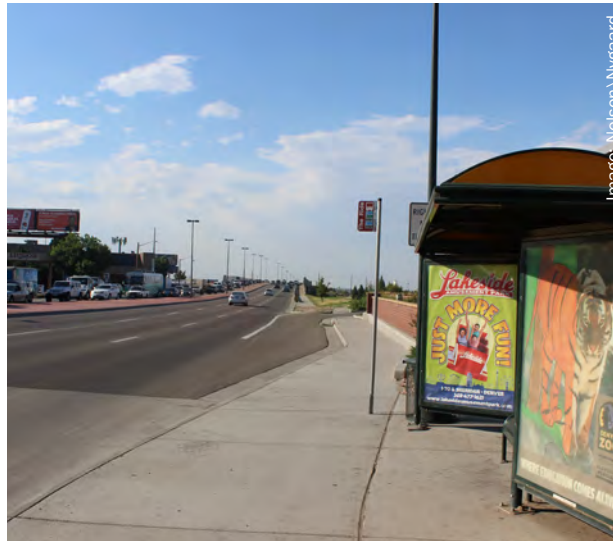
This shelter, funded through advertising, is not maintained by RTD and lacks printed transit information.