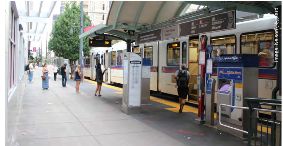
Rail stations have the highest level of amenities, including real-time information and off-board fare payment.