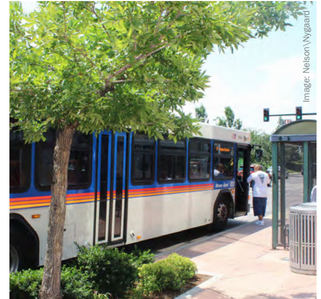
This bus stop at 1st and Fillmore Plaza in the Cherry Creek shopping center has a shelter, printed information, and trash cans.