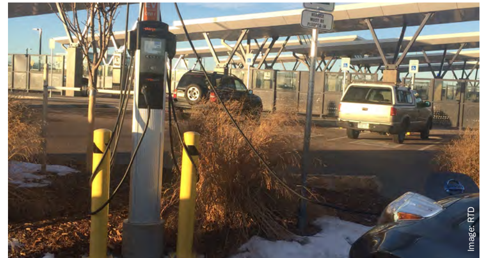
Designated EV parking spots located at Central Point Station are available to ChargePoint customers and can only be used by vehicles that are plugged in.