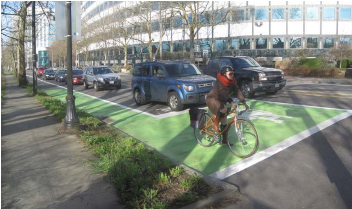
Figure 3.3: Intersection remedial designs

For more information see: http://nacto.org/publication/urban-bikeway-design-guide/intersection-treatments/