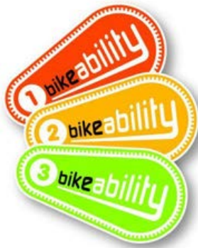
Figure 3.5: Bikeability cycle training

For more information see www.bikeability.org.uk