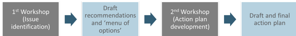
Figure 2.1: Process

Development of the Action Plan followed an accelerated schedule, in part to provide timely information to other City departments on any items to be requested within the 2016 budget process. The process developed through two central workshops with the project's stakeholder Task Force. Figure 2.1 displays the project's general process and flow.