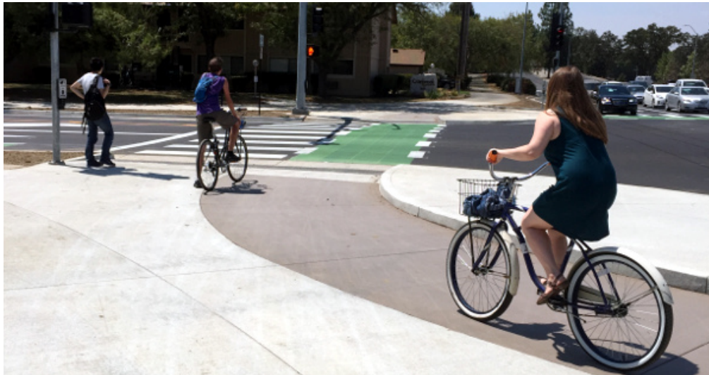
Figure 3.4: City of Davis, CA protected intersection

Although Davis, CA is the first city to implement the protected intersection, other cities like the City of Salt Lake, UT and the City of Austin, TX, are all constructing protected intersections.