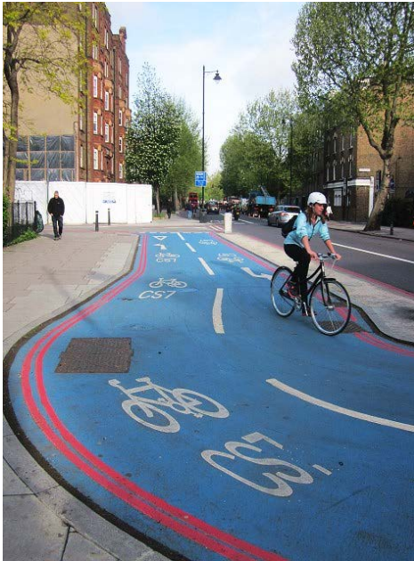
Figure 3.2: Cycle superhighway distinctive coloring, standardized infrastructure and wayfinding

For more information see: https://tfl.gov.uk/modes/cycling/routes-and-maps/cycle-superhighways